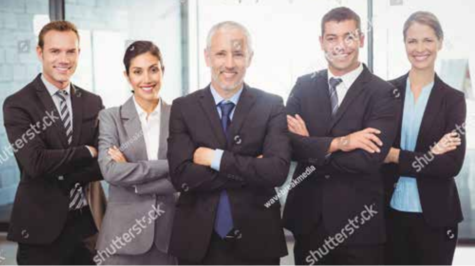
A quality photo of the Lydolph & Weierholt team. This caption would contain the names (and possibly roles) of the people in the photo.