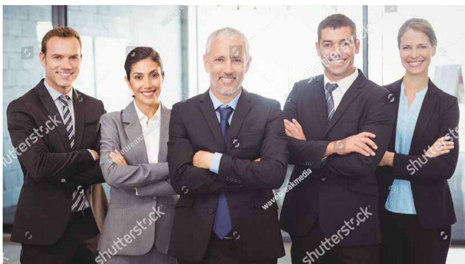
A quality photo of the Lydolph & Weierholt team. This caption would contain the names (and possibly roles) of the people in the photo.